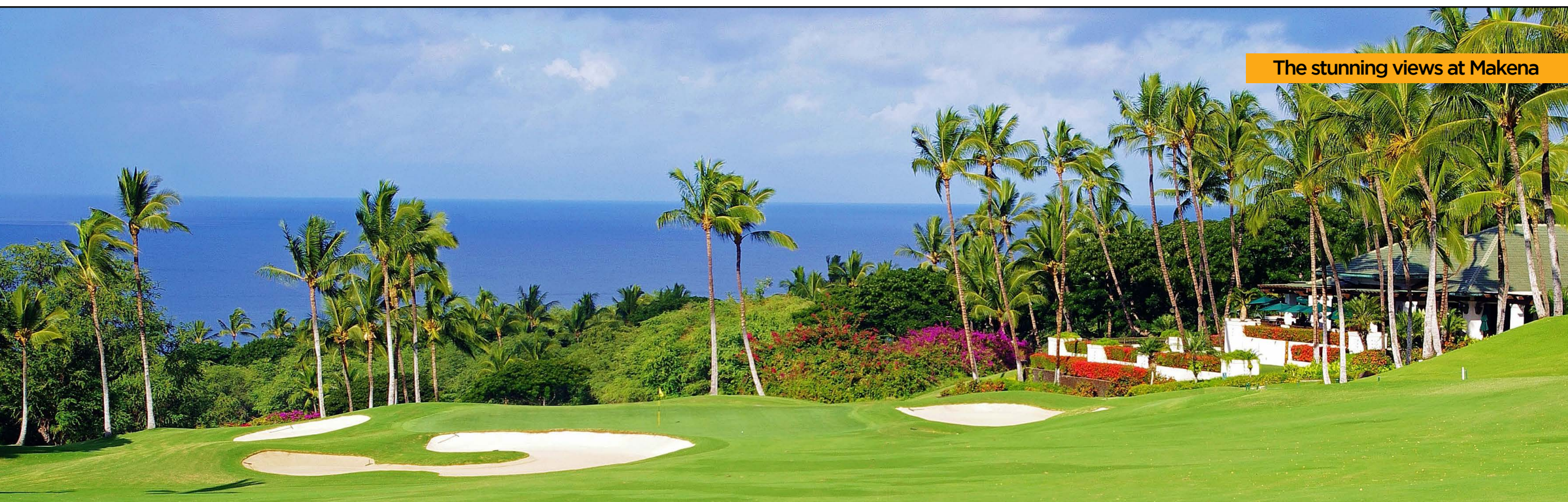
The stunning views at Makena