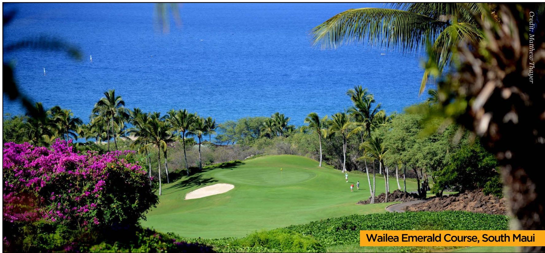
Wailea Emerald Course, South Maui

The Challenge at Manele is a Jack Nicklaus design that ranks in the top-50 best public golf courses in America and one of the most visually stunning golf courses you'll ever play. The dramatic elevation changes, volcanic rock outcroppings, perfectly manicured bunkers and magnificent ocean vistas make every hole a standout.