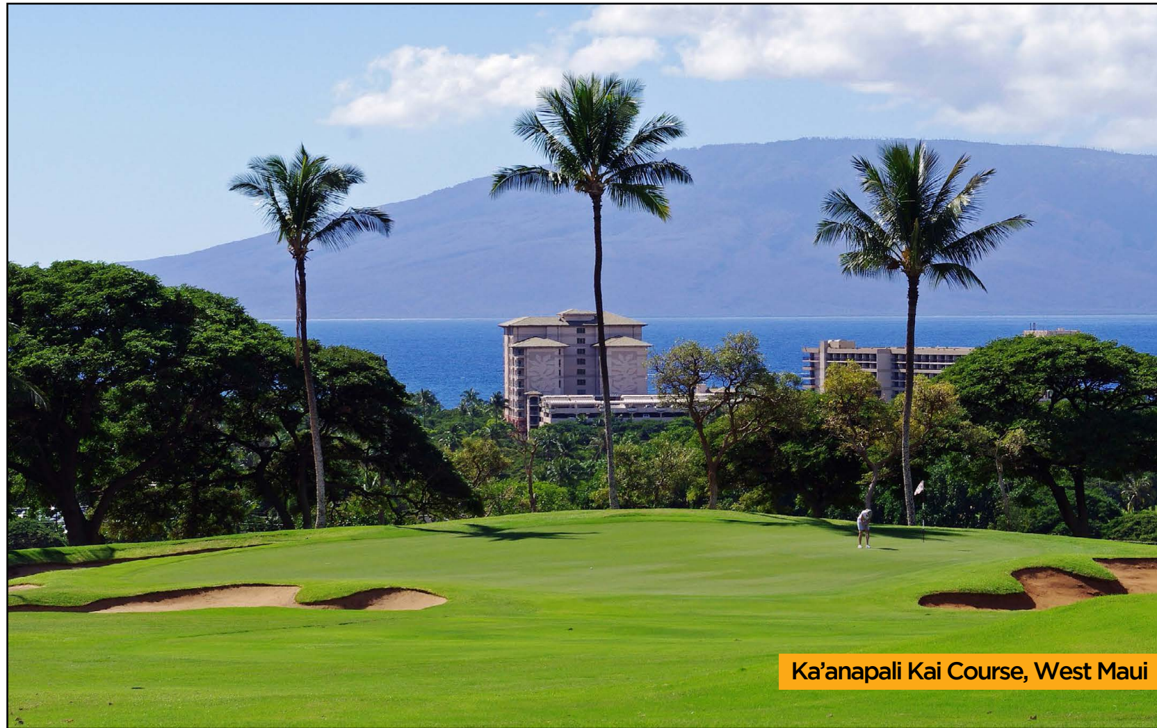
Ka'anapali Kai Course, West Maui

It seemed only fitting that our first stop was Ka'anapali where the legend began in 1962 when Robert Trent Jones Sr. built Maui's first course. The following year the Sheraton at Black Rock opened to cater to the likes of Sam Snead and Bing Crosby who simply thought of it as 'home.' Today there are more than fourteen golf courses within striking distance of the Sheraton and an infinite array of accommodations for travelers like us who simply want to enjoy the good life with family and friends on one of the best beaches in Hawaii.